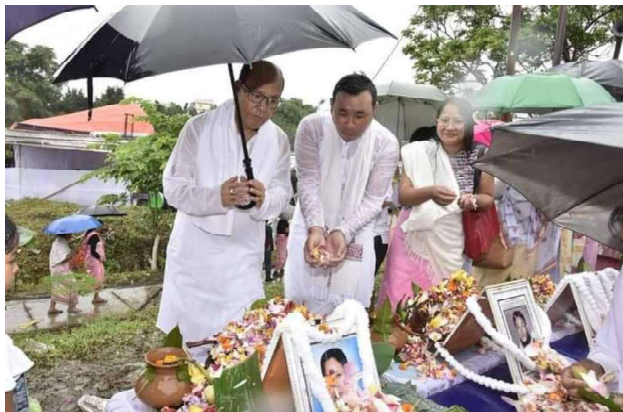
IT News Imphal, June 18:

Amidst heavy rains that pours since early morning thousands from all sections of communities in the state today gathered at Kekrupat here in Imphal to pay homage to the June 18 martyrs of the state.