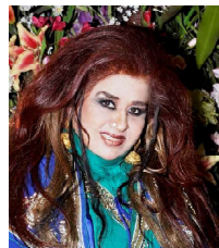
By: Shahnaz Husain

himself, here we bring to you a complete yoga routine that you can follow to maintain your immunity.